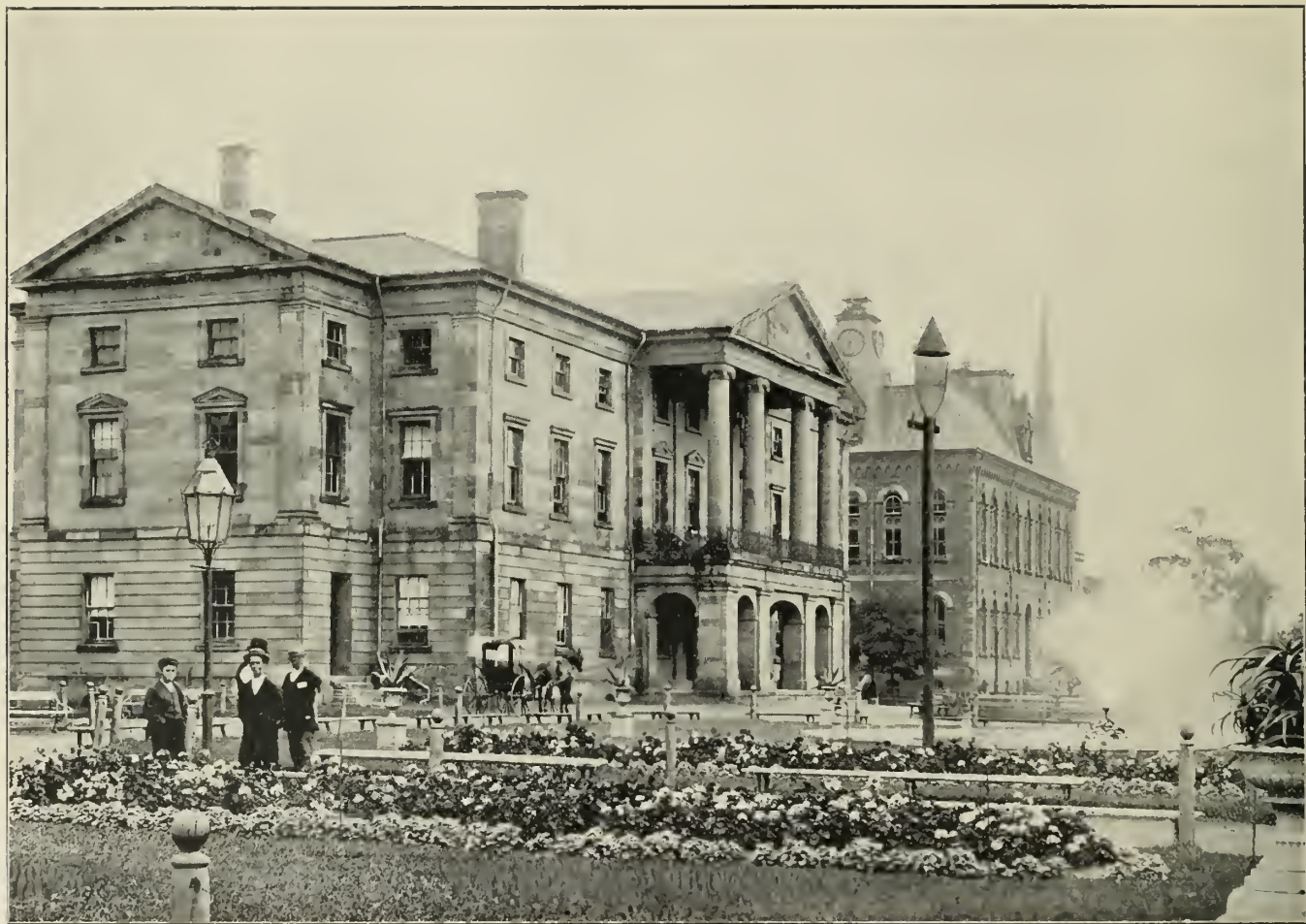
PROVINCIAL BUILDING, CHARLOTTETOWN.